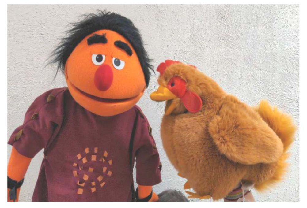
The Trinity Puppeteers invite you to their presentation of ...