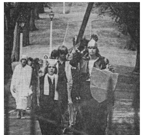
The first Cross Walk in 1975!